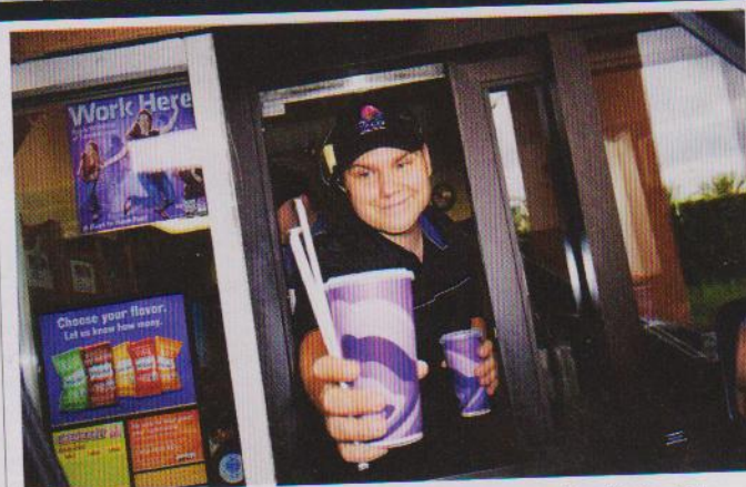
Service Champion A 164-second window to complete a Taco Bell order